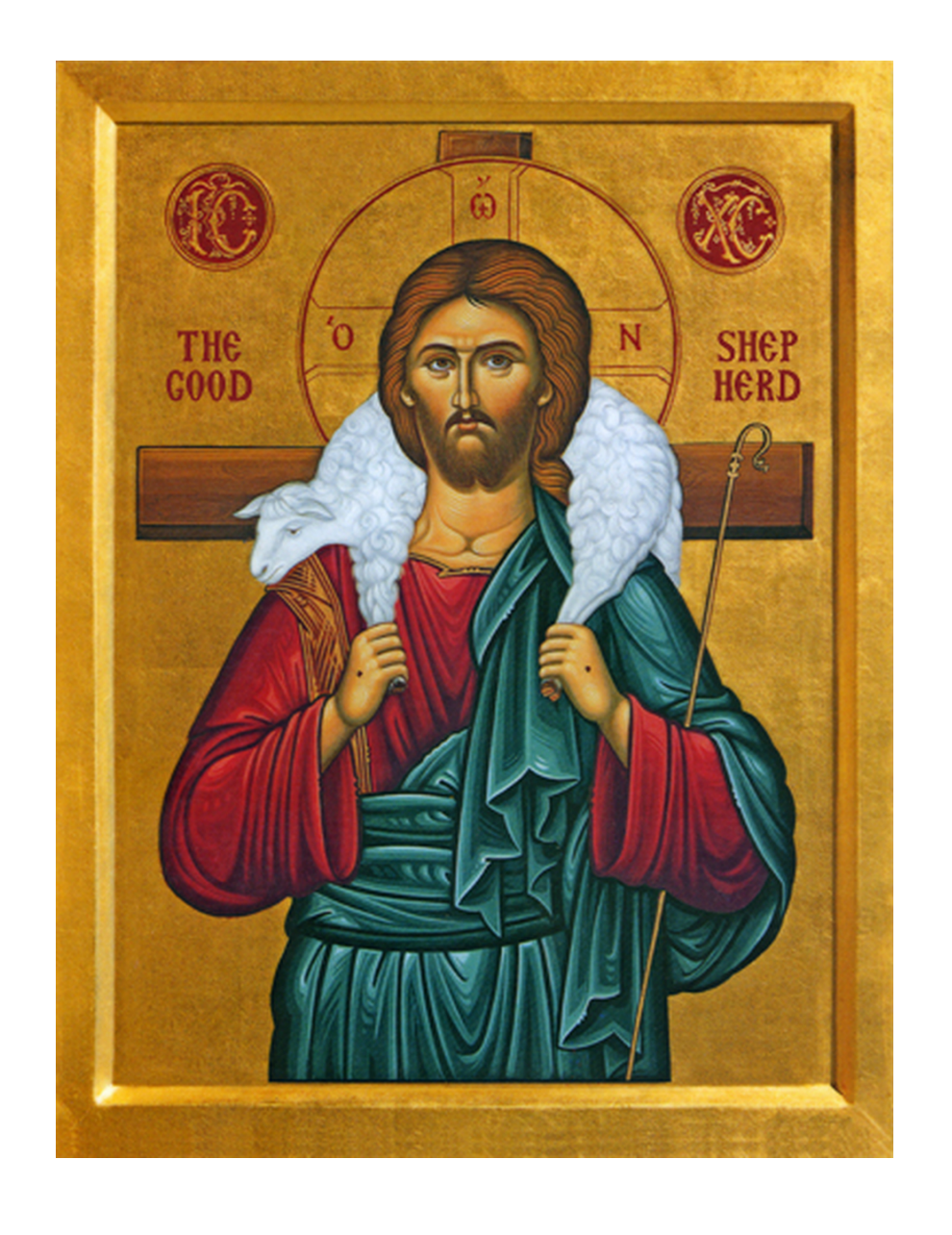
A Prayer Guide for Family and Friends Who are Ill & Dying

Adapted from the Book of Common Prayer 2019